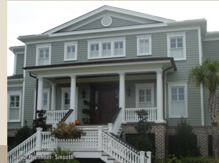
Sierra Premium Smooth