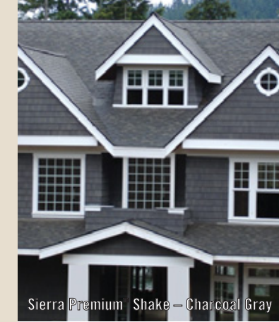
Sierra Premium Shake - Charcoal Gray