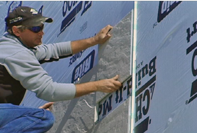
Nichiha Fiber Cement Resists Moisture Build-Up